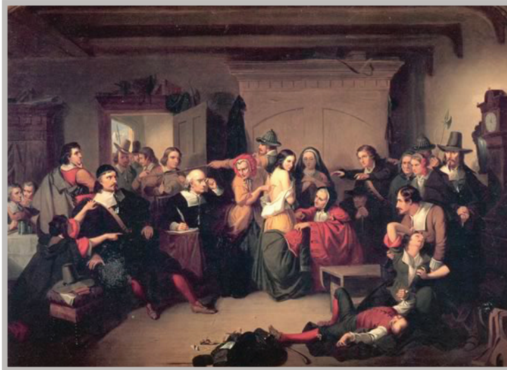
"Examination of a Witch (1853)" by T.H. Matteson, inspired by the Salem witch trials